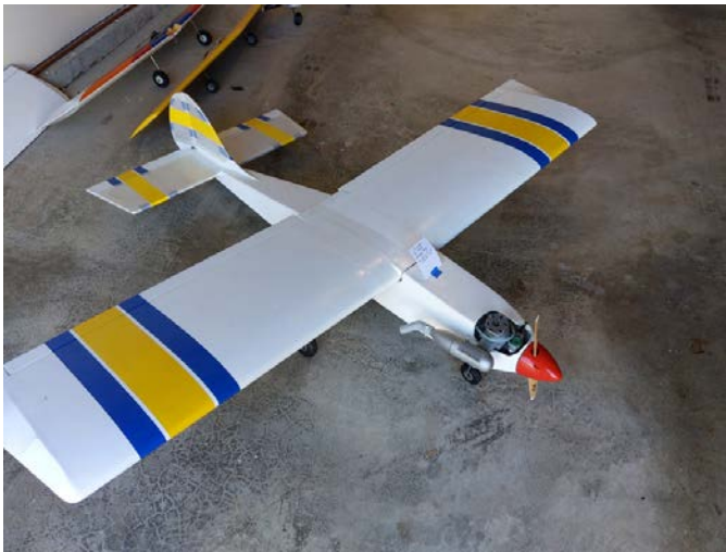
Modified Stik with OS .61, not flown?