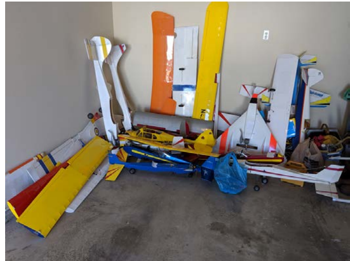
View of Jerry's planes in Babe Raab's garage.

Below are photos of the individual airplanes and short descriptions.