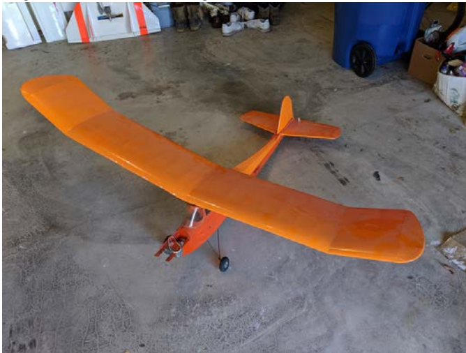
Radio-assisted "Buzzard Bombshell" free-flight!