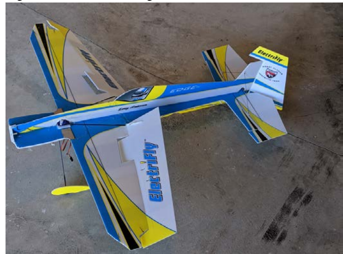
Indoor electric, includes servos, less motor and receiver.