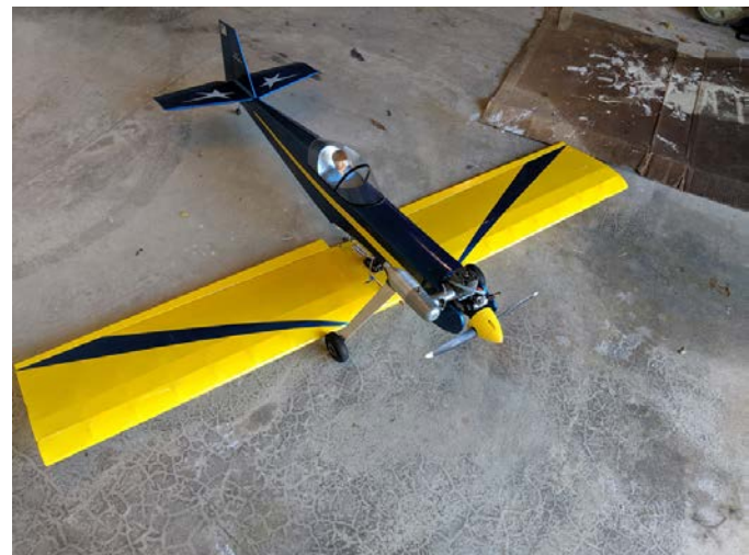
Sig Four Star-40 with Super Tiger GS-40 engine.