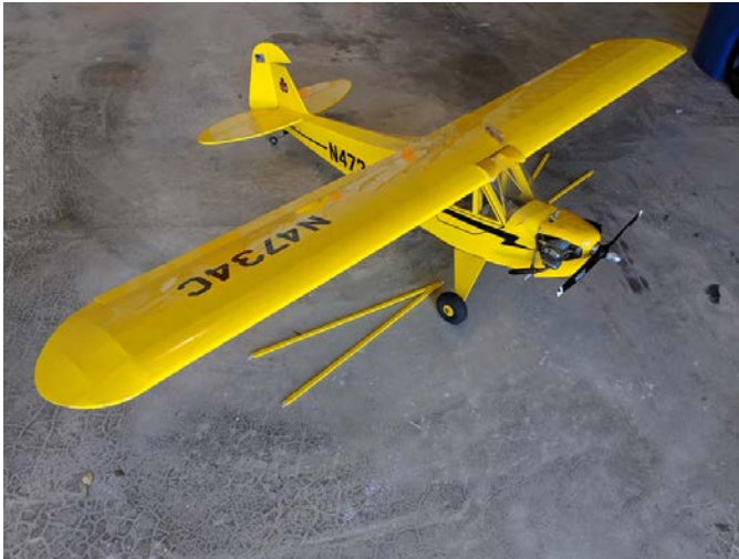
Sig J-3 Cub with Saito 4-stroke engine.