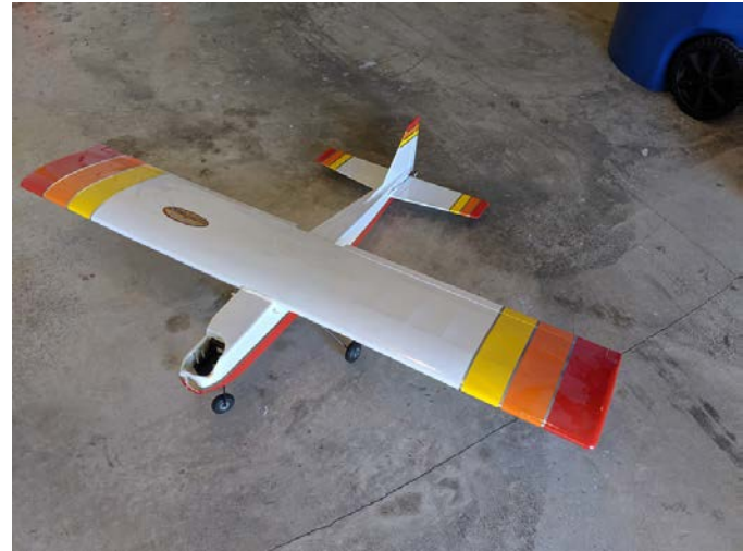
.25? size airframe...never flown.