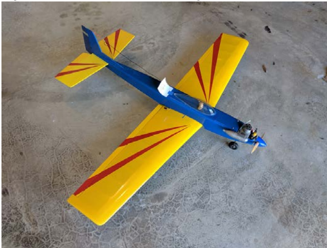
"Kaos" with OS .25.