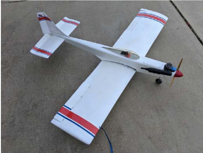
60 size, with tricycle gear.