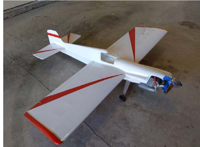
Cassutt racer with Cox .15 Conquest engine...never flown! NICE!!!