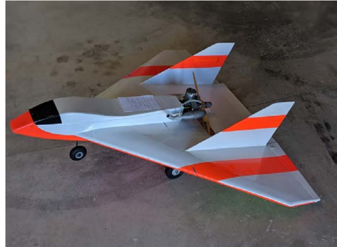
Balsa USA "Force One" with Fox engine...never flown!