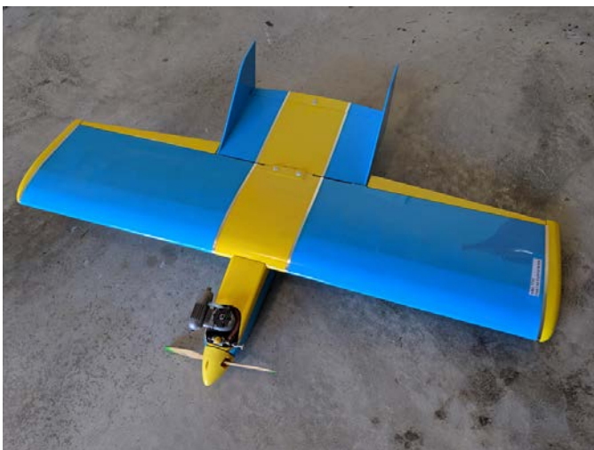
Sig "Wonder" with OS .15...never flown and beautiful!