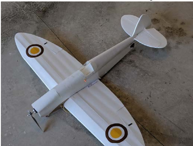
Flite-Test foam board electric Spitfire.