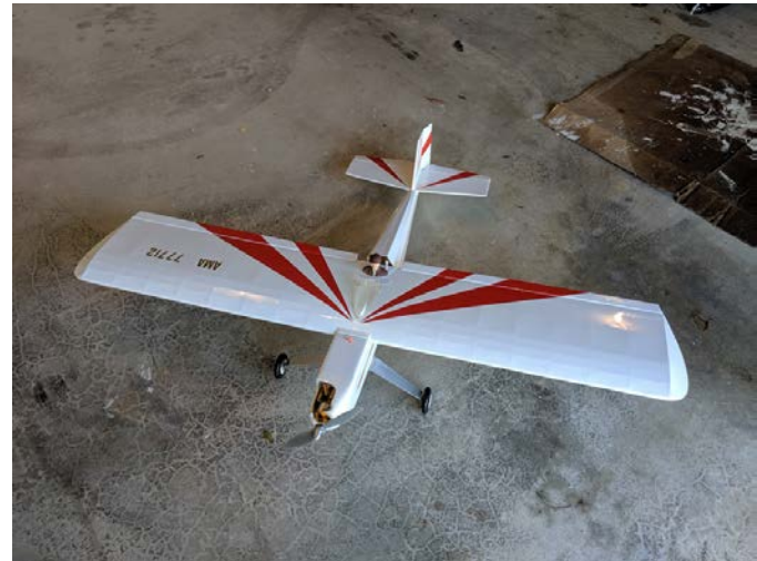
Sig "Mid-Star" mid-wing electric...never flown?