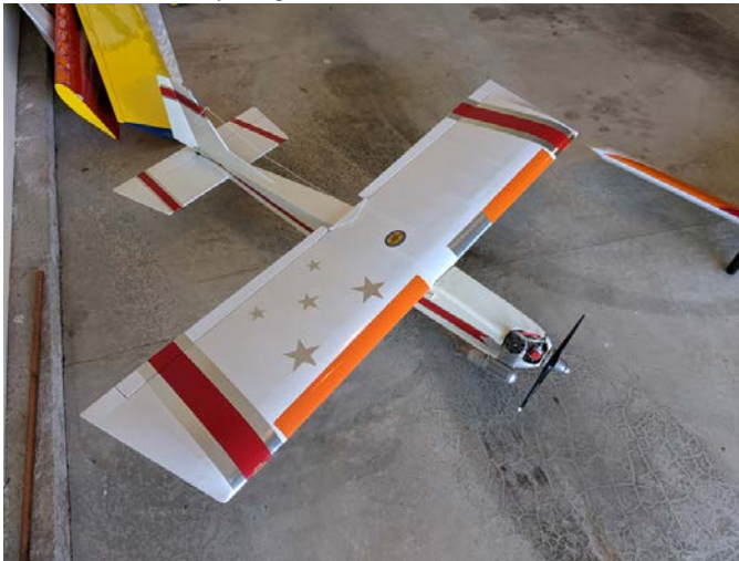
Modified Stik with OS .40, not flown?