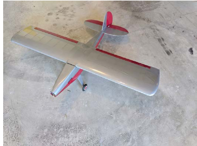
Spirits of St. Louis racer for .15 size engine.