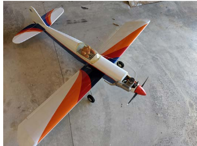
Super Sportster .40.