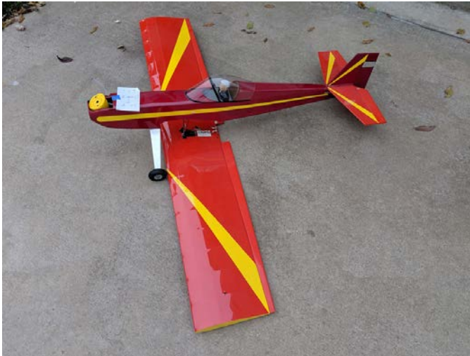
Sig Four-Star-40 less engine.