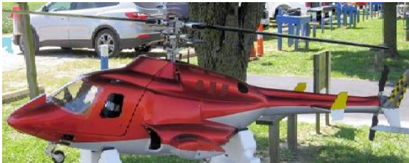
9:00 AM – dusk

Support our friends at: MARK TWAIN HOBBY CENTER WWW.HOBBY1.COM