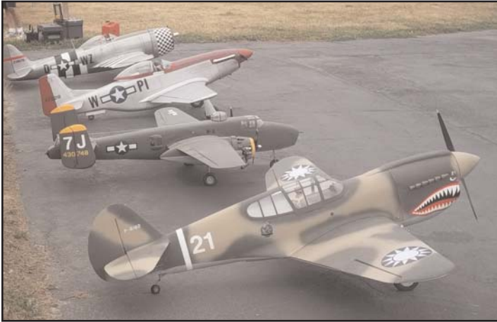
Some great-looking large scale Warbirds at the Buder Park GSLMA Big Bird Fly-In on July 14. No info on whose planes they are.