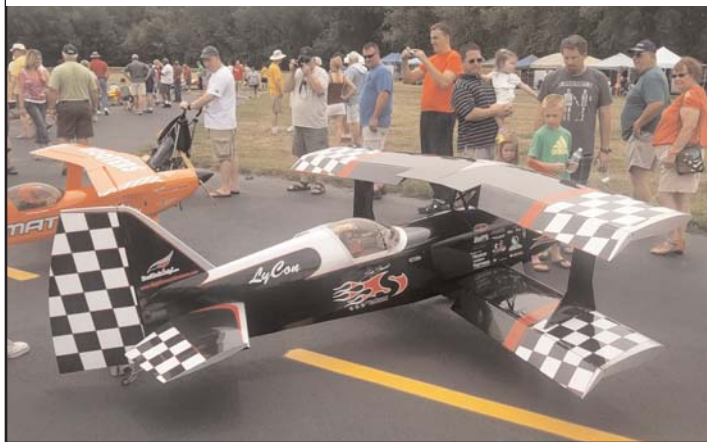
A pair of very big, beautiful Bipes at the Buder Park GSLMA Big Bird Fly-In on July 14.