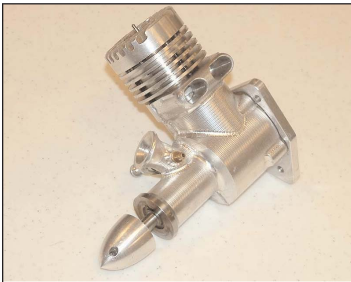
Dennis Skeeters purchased this home-made engine at a flea market, for $10.00, including two props! It has poor compression, but runs.

A discussion ensued on how to increase participation in our Racing and Fun-Fly events. Lee Volmert suggested no entry