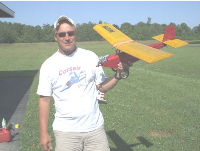
Jeff Muhus Petepiole OS-10 1oz fuel tank Built in late 50's early 60's not sure when 3 channels first flight flew great!

PICTURES FROM EUREKA JET FLY, June 21-22