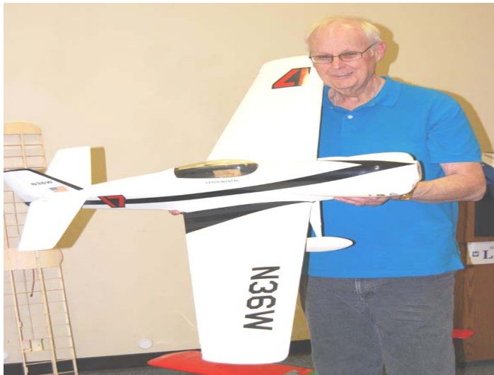
Walt also showed and discussed the first R/C plane he built, 37 years ago. It's a Jack Stafford Minnow and was powered by a rear-intake K&B .40 engine which was state-of-the-art for Formula 1 racing at the time.