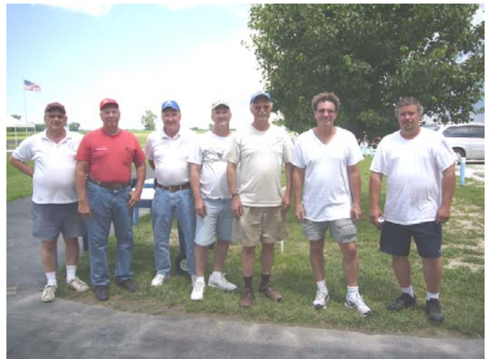
All the Participants of the Race