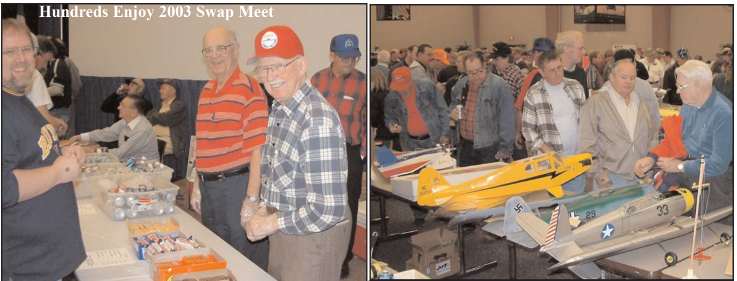
Hundreds Enjoy 2003 Swap Meet