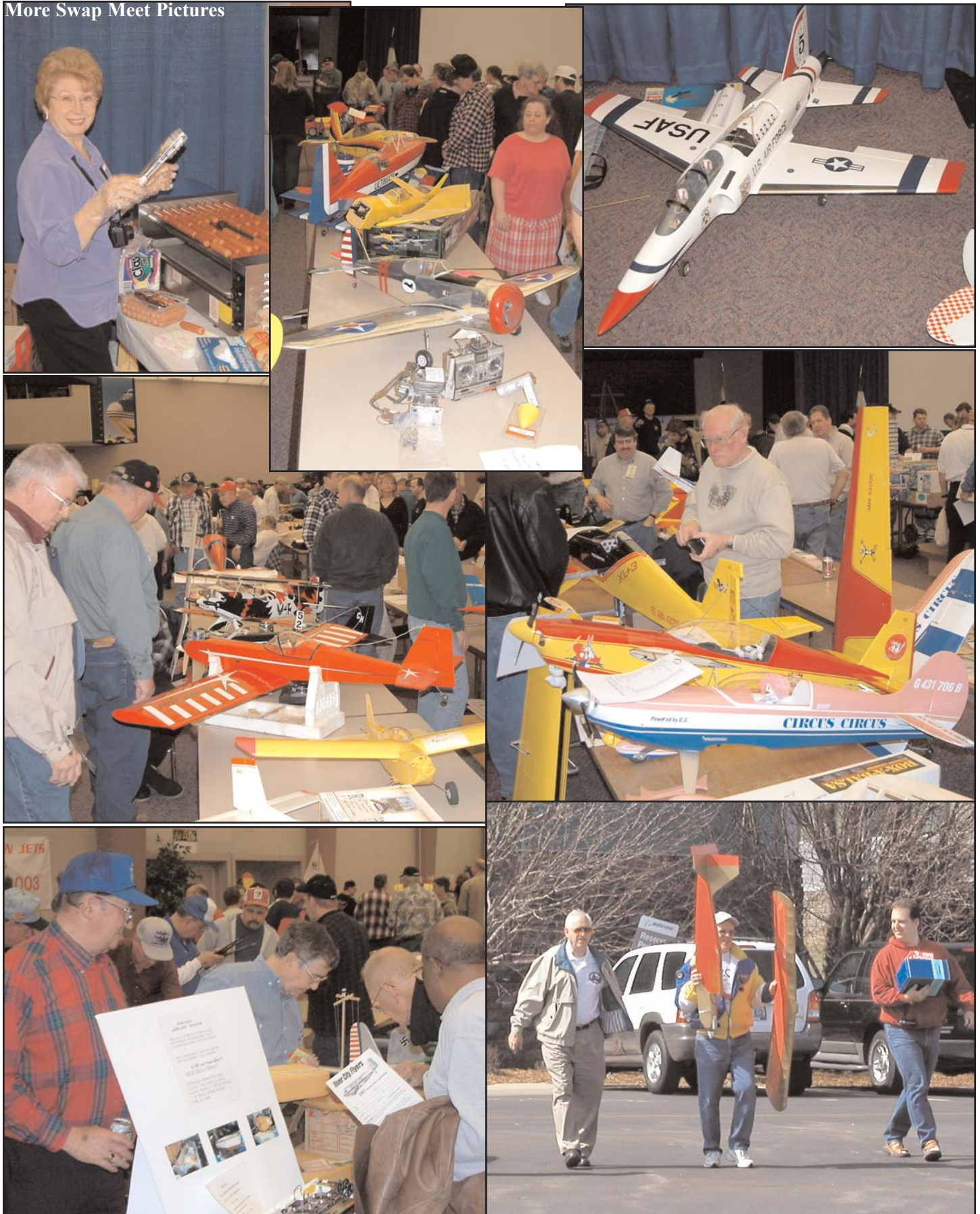
More Swap Meet Pictures